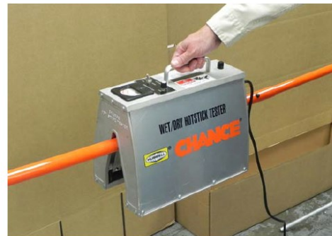
Chance® hot-stick tester in laboratory use. This instrument is recommended by Chance as a field check (sticks tested dry) and as an alternate to the OSHA laboratory test (sticks tested wet).

In response to the new OSHA regulations, Chance performed an extensive test series. Tests on new and used hot sticks compared the results using IEEE tests prescribed in the OSHA Regulations and the Chance Portable Hot Stick Tester. Wet tests were of particular interest because of the OSHA wet test requirements. The purpose was to determine the appropriate uses of the Chance Hot Stick Tester. Other objectives were to obtain a comparison between wet and dry tests and to determine the effectiveness of wax versus silicone oil. In 1995, Chance introduced a redesigned Wet/Dry Hot Stick Tester to test to the new standards [Cat. No. C4033178 (110 VAC) and Cat. No. C4033179 (230 VAC)].