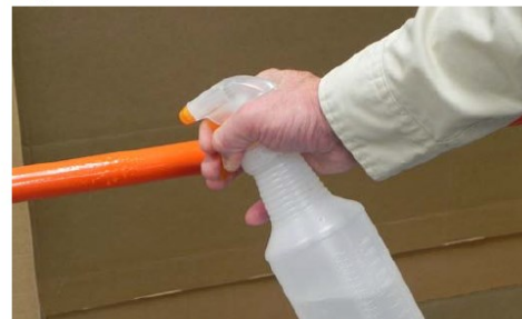
To pass the OSHA wet test, water must bead up rather than wet out the surface. Wax or silicone will enhance this property if the surface is in satisfactory condition.